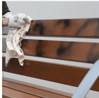
Protector for materials from paints, graffiti ....