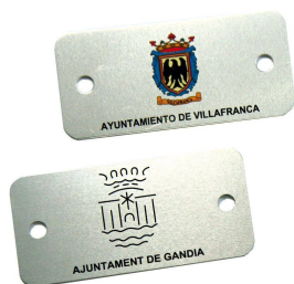
Aluminium plate 74 x 35 mm.